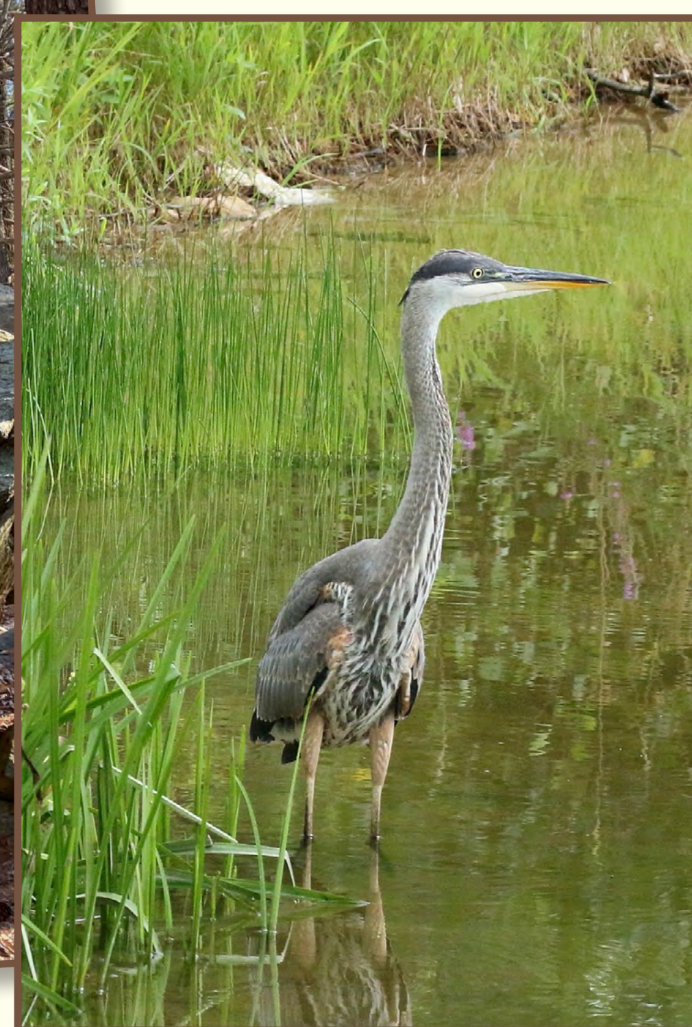
A great blue heron quietly stalks the shores of the Lamprey River at Heron Point.