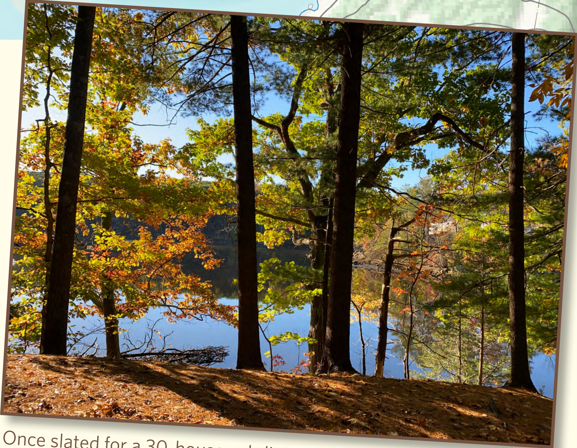
Once slated for a 30-house subdivision, these 32 acres were instead given to the Town of Newmarket in 1996 as a place for observation and quiet reflection.