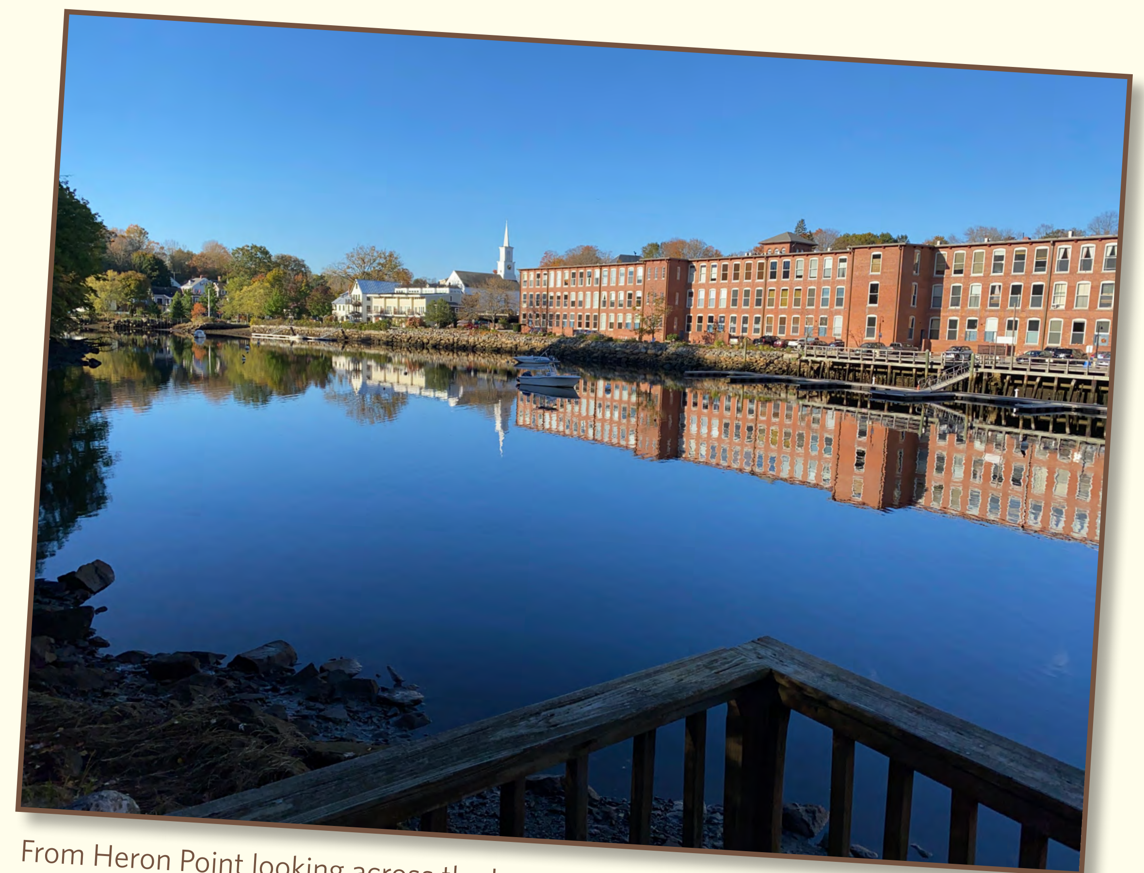
From Heron Point looking across the Lamprey River to the Newmarket Mills and Community Church, 2021.