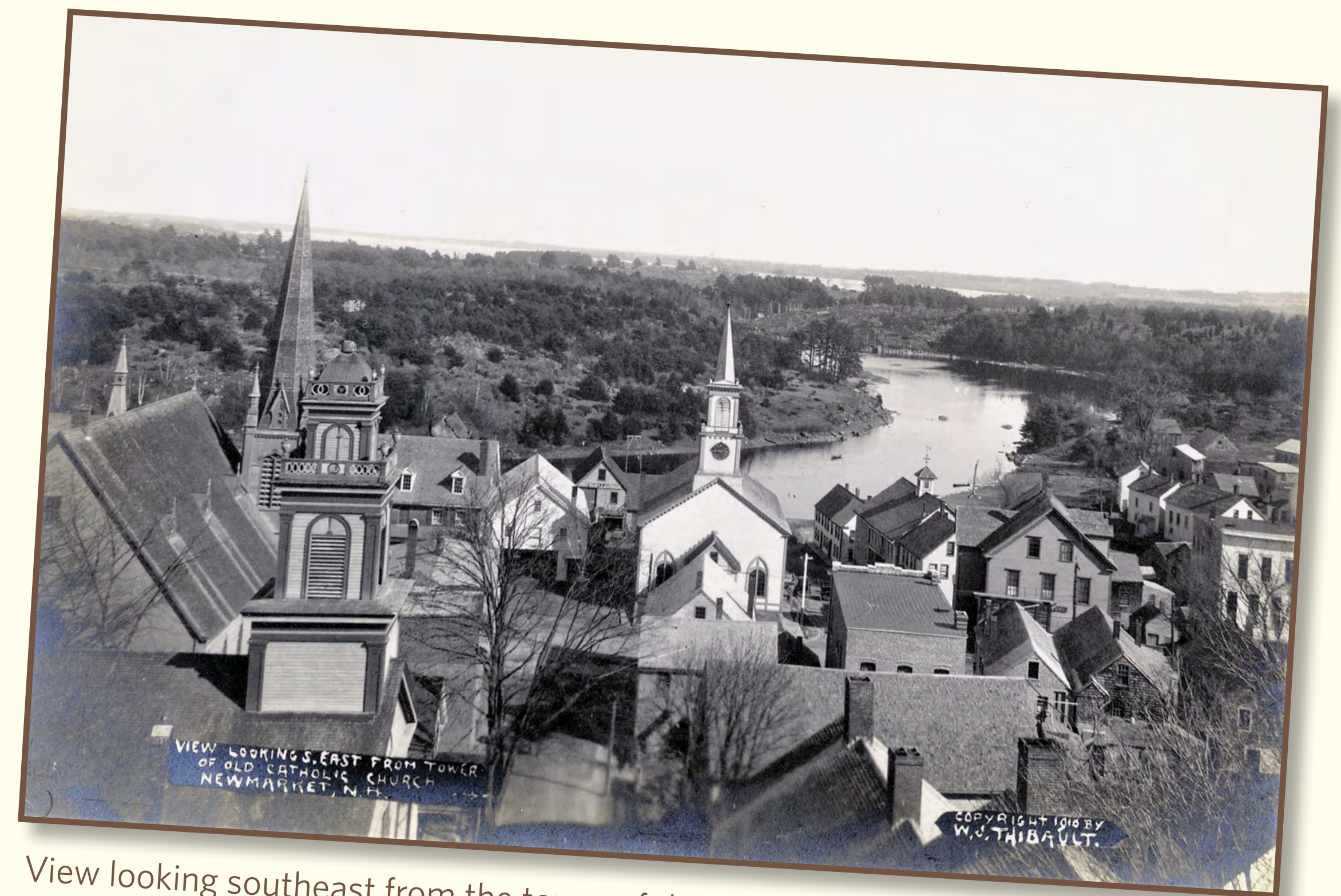
View looking southeast from the tower of the old Catholic Church to a nearly treeless Heron Point, 1910.

This sanctuary is managed by the Newmarket Conservation Commission with help from the Department of Public Works and volunteers.