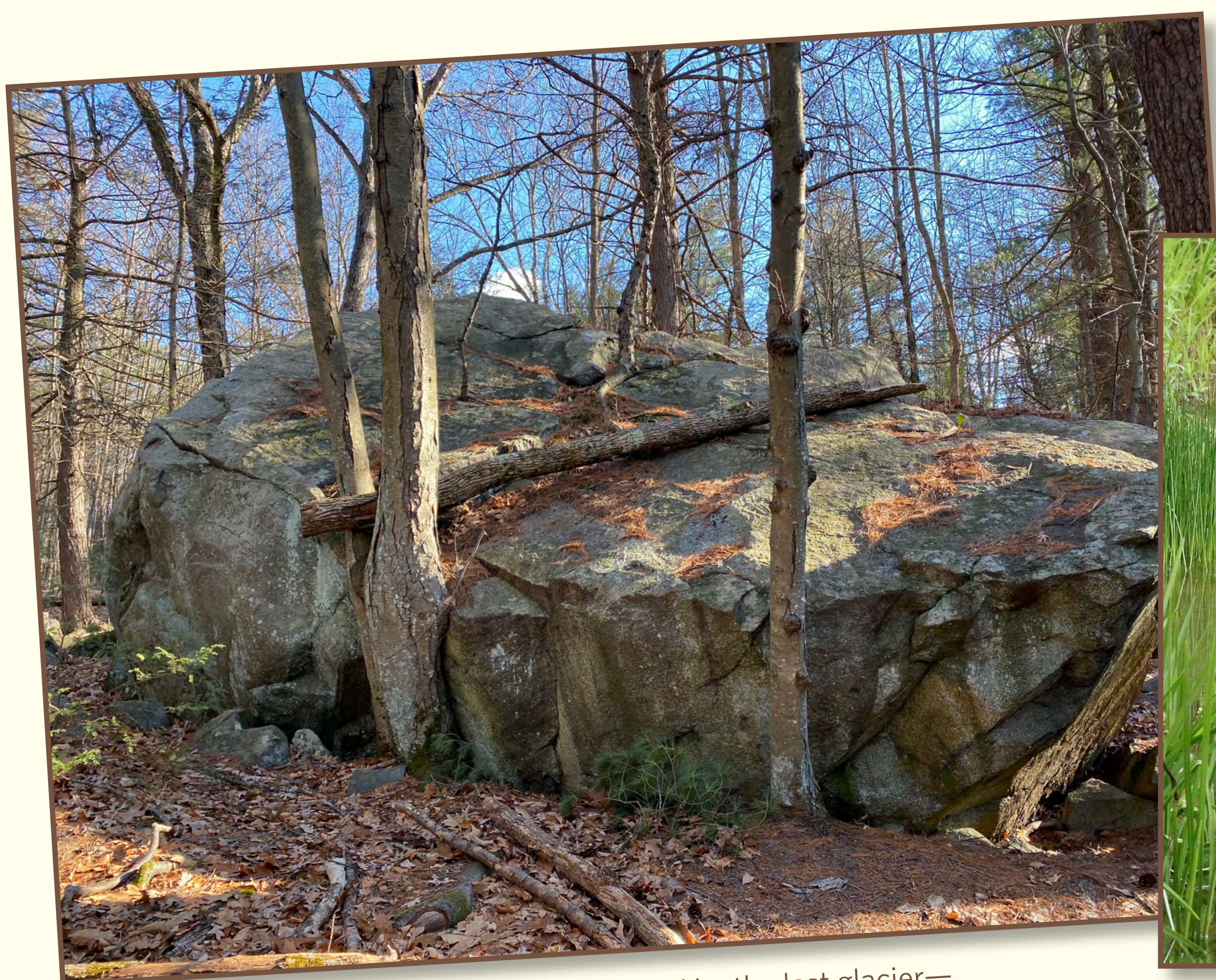
One of many large erratics—boulders deposited by the last glacier—at Heron Point Sanctuary.

Heron Point preserves nearly 3,000 feet of shoreline along the Lamprey River that includes salt marsh, mudflats, rocky shores, and open water. You can help protect this critical interface between land and water and a healthy natural environment by staying on trails and off steep slopes to prevent erosion.