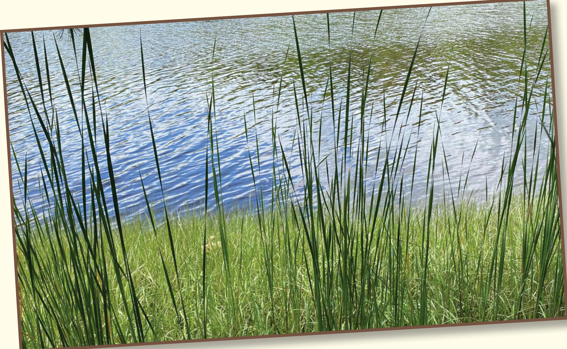
The salt marsh along the banks of Heron Point prevents erosion and offers habitat for aquatic life.