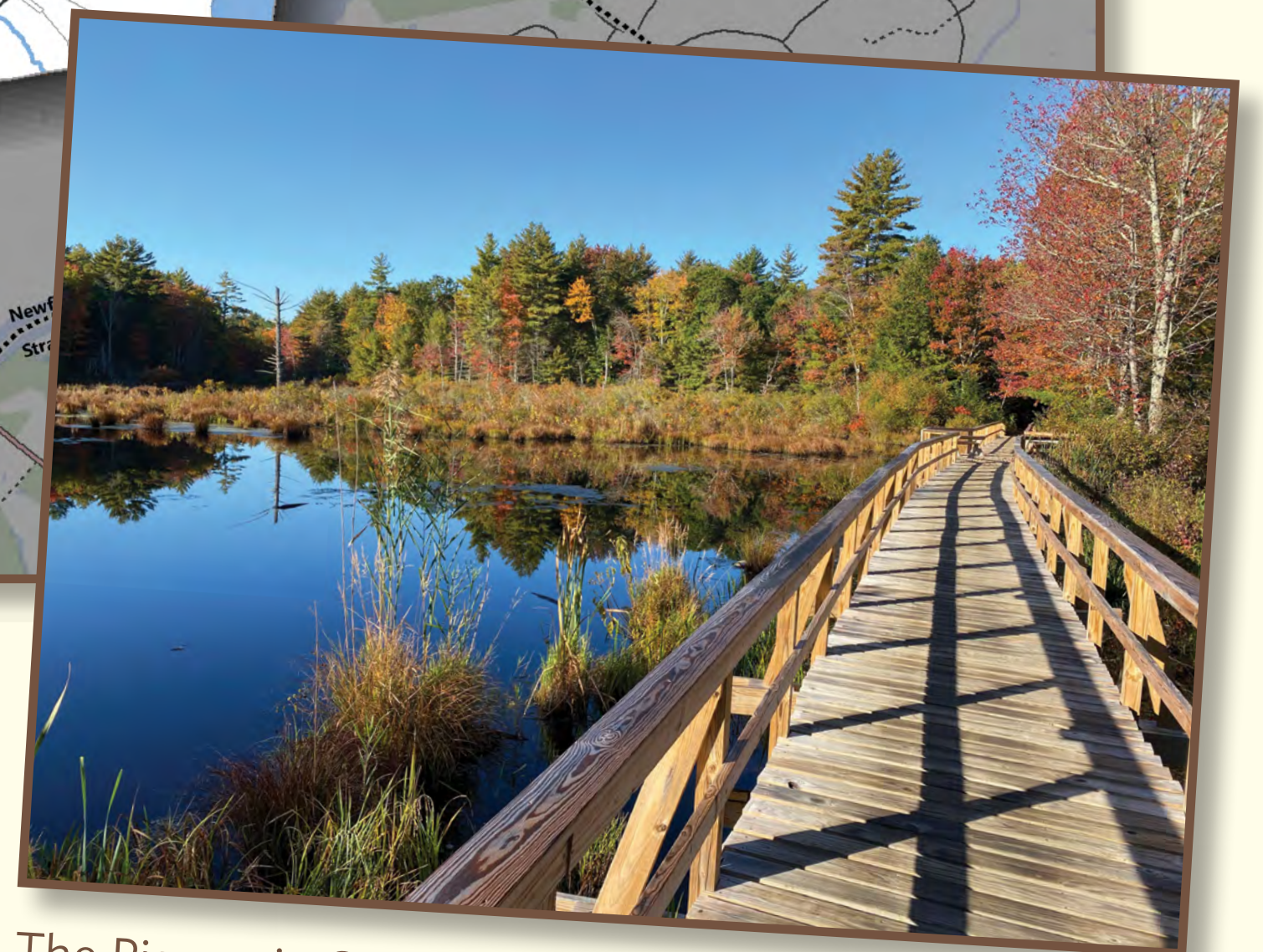
The Piscassic Greenway offers 3.5 miles of trails in Newmarket and Newfields.